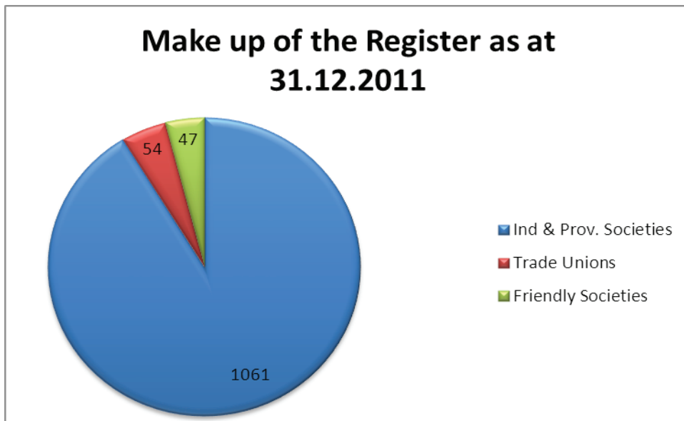
Fig. 1: Ratio of I&P Societies, Friendly Societies and Trade Unions at end 2011.

The charts below show the ratio of Industrial and Provident Societies, Friendly Societies and Trade Unions on the register at 31 December 2011, and over the years 2002-2011.