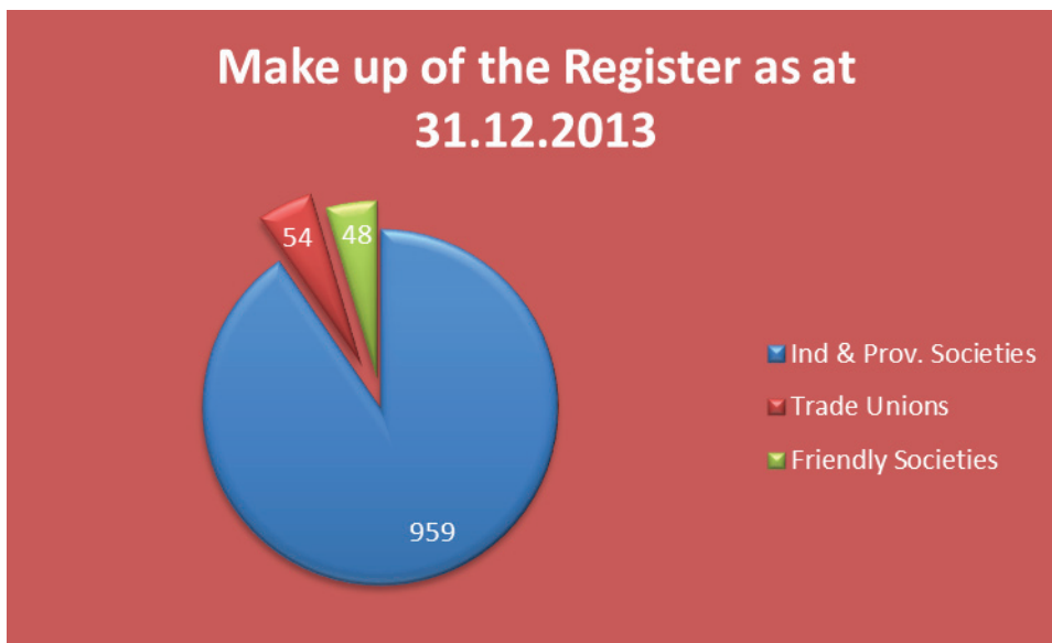
Fig. 1: Ratio of I&P Societies, Friendly Societies and Trade Unions at end 2013.

The charts below show the ratio of Industrial and Provident Societies, Friendly Societies and Trade Unions on the register at 31 December 2013, and over the years 2004 – 2013.