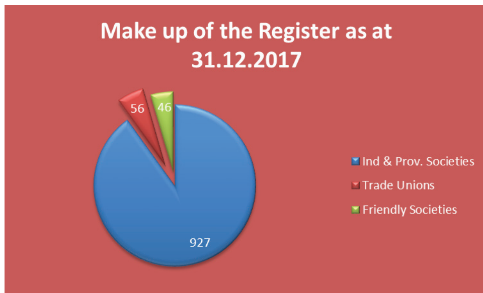
Fig. 1: Ratio of I&P Societies, Friendly Societies and Trade Unions at end 2017.

The charts below show the ratio of Industrial and Provident Societies, Friendly Societies and Trade Unions on the register at 31st December 2017, and over the years 2008 – 2017.